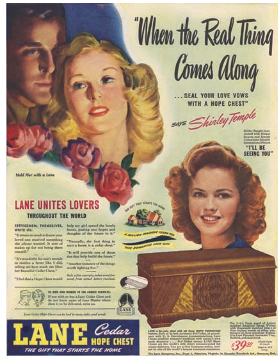
Lane Company advertisement, featuring Shirley Temple. (Mss3L2453a.FA2.1945)